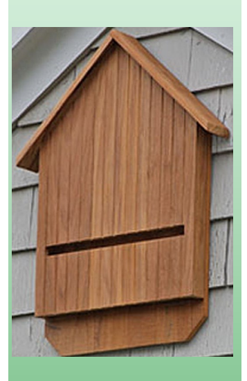
Example of a bat house