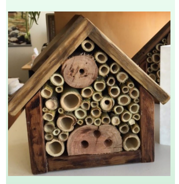
Example of a native bee house

Remember—there are two TSC stores in Kalamazoo, one on Gull Rd. and the other on Shaver Rd. If you purchase your clovers at either of these stores you will be helping to